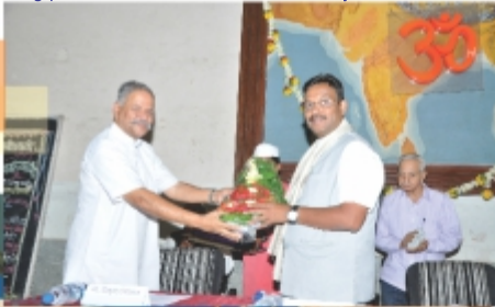
Education Minister of Maharashtra Shri Vinodji Tawade visited Prashala.