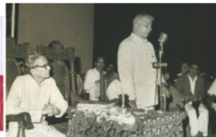
The First Chief Minister of Goa & Vice-President of Prabodhini Hon. Dayanand Bandodkar in Prashala