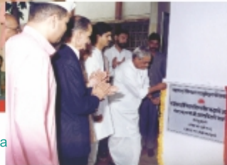
The then Prime Minister Shri.Atal Bihari Vajpeyee at the inauguration of Sanjeevan Hospital managed by JPP alumni