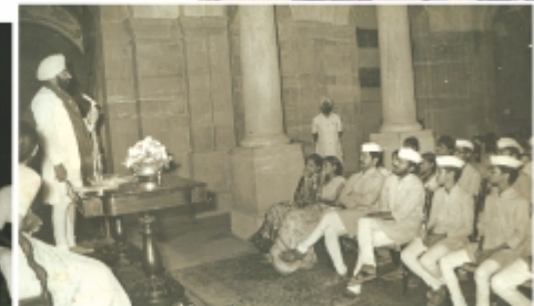
A visit to the Rashtrapati Bhawan, New Delhi. Hon. President Giani Zail Singh