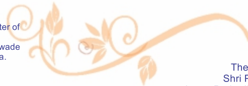
The then HRD Minister Shri P.V.Narasimha Rao at Jnana Prabodhini Prashala, Pune