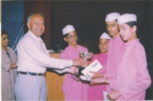
Internationally renowned Astrophysicist Prof. Jayant Narlikar distributing prizes to students on 'Science Day'